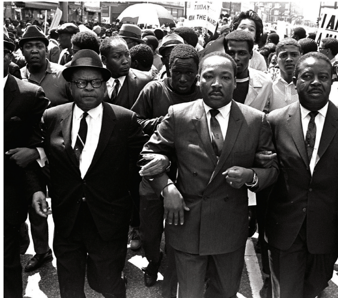
The Freedom Walkway was dedicated as part of the event in Rock Hill.