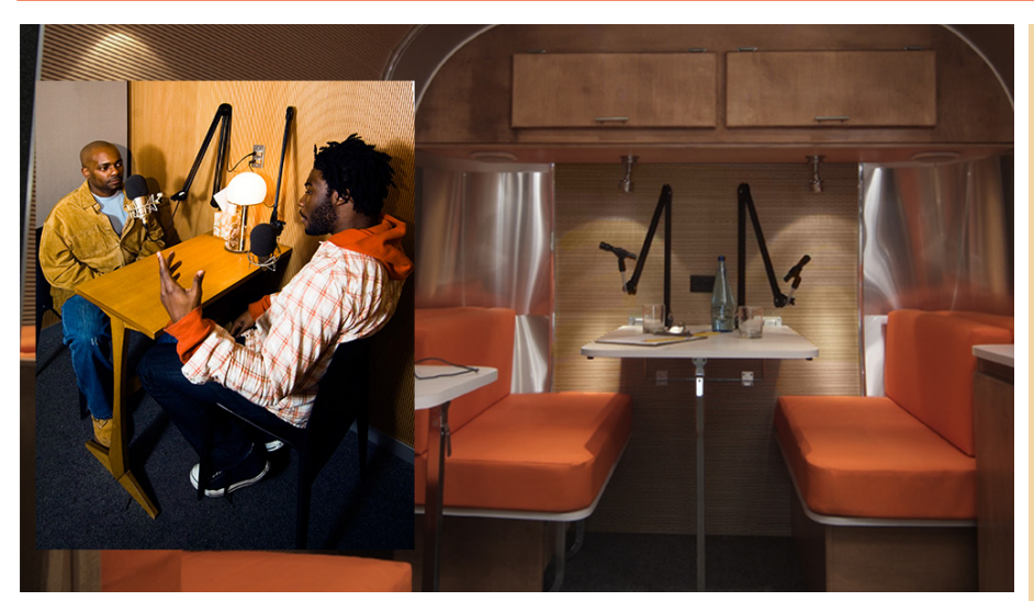
Inside the StoryCorps Mobile Booth.